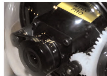
160° Vertical Tilt, Manual Focus Hi-Res Camera

Rear facing high resolution black & white 430 lines of resolution / 0.1 lux